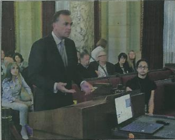
Developer Rick Caruso makes a brief presentation about his Palisades Village project at a public hearing on Thursday, March 24 at City Hall.